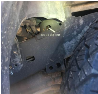
Figure 6 Left Front Bolt Lube Location