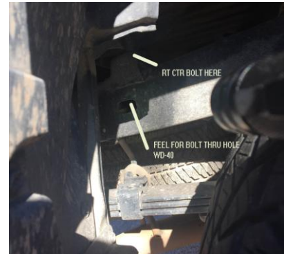
Figure 8 Right Center Bolt Lube Location