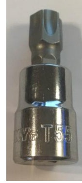
Figure 3 3/8" T55 TORX